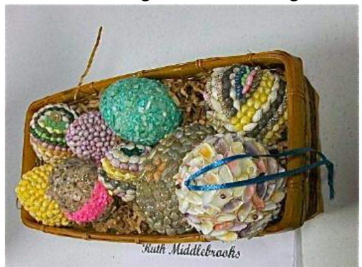
Members brought Show and Tell Work to Share