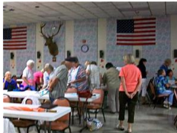
October Meeting at the Elks Lodge